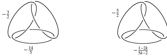
Figure 1: Surgery presentation for all (distinct) hyperbolic knots with two lens space fillings obtained by surgery on the minimally twisted 5-chain link.

In the present paper, we are interested in hyperbolic manifolds X with a torus boundary component \tau supporting a pair (\alpha, \beta) of exceptional slopes whose associated surgeries lead respectively to manifolds of types C_1 and C_2 , where C_1, C_2 \in \{S^H, S, T^H, T, D, A, Z\} , the set of exceptional type manifolds described above. We will summarize this situation by writing (X, \tau; \alpha, \beta) \in (C_1, C_2) . The distance (minimal geometric intersection) between two slopes \alpha and \beta on a torus is denoted by \Delta(\alpha, \beta) . The maximal distance between types of exceptional manifolds C_1 and C_2 is defined as the \max \{\Delta(\alpha, \beta) \mid (X, \tau; \alpha, \beta) \in (C_1, C_2)\} and denoted by \Delta(C_1, C_2) .